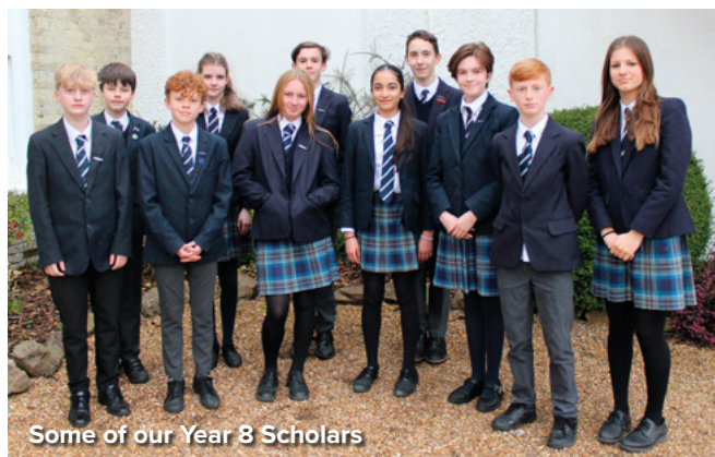
Some of our Year 8 Scholars