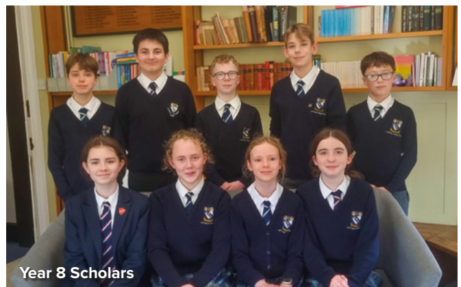
Year 8 Scholars