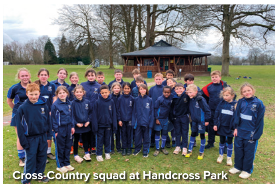
Cross-Country squad at Handcross Park